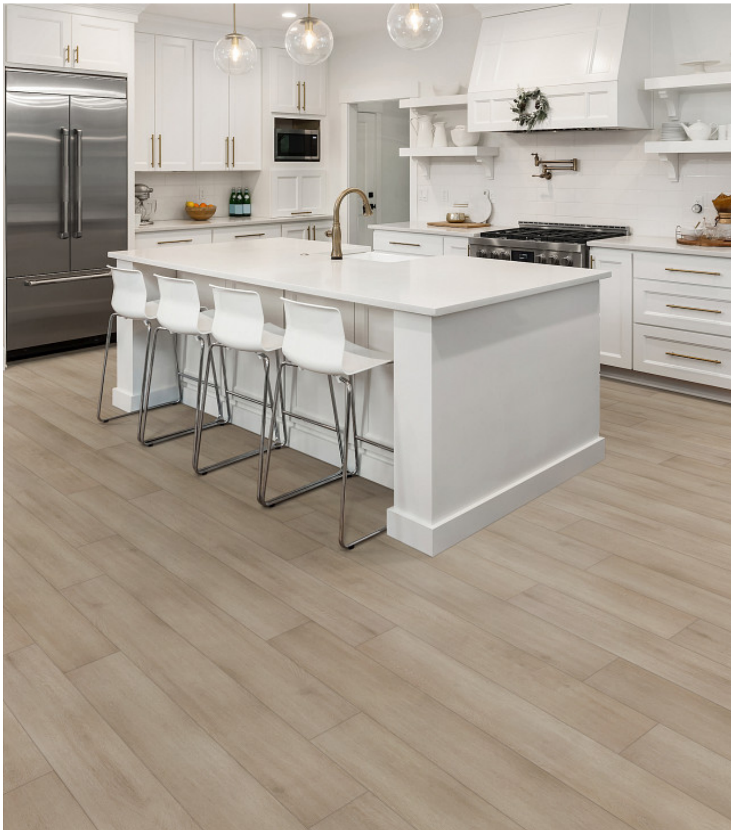
7319 Serene Greige